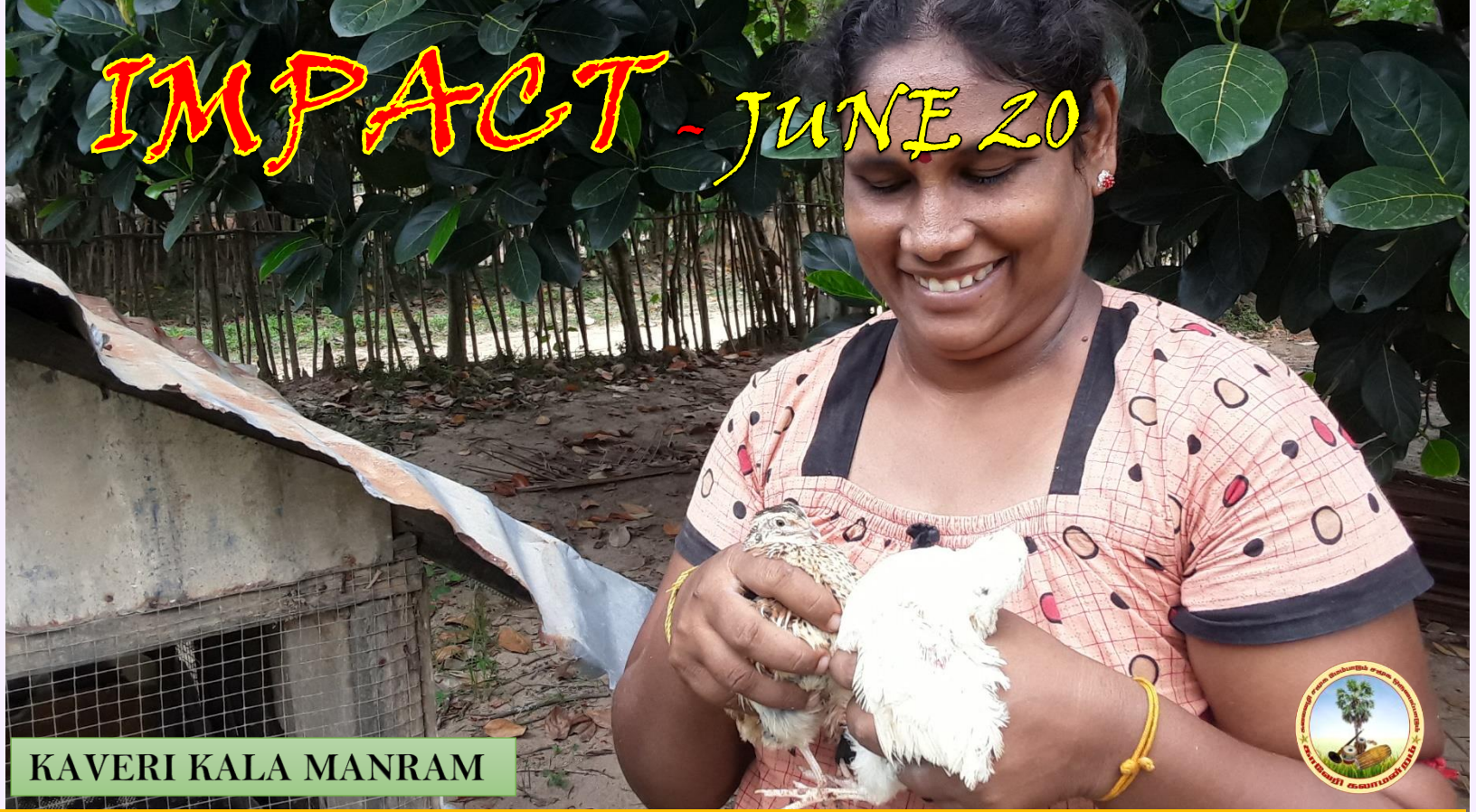
KAVERI KALA MANRAM